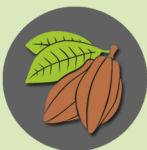
Committee on Commercial Crops