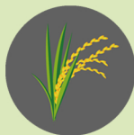
Committee on Food Staples