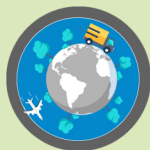
Committee on International Trade