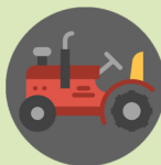
Agriculture and Fishery Mechanization Committee