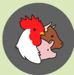
Committee on Poultry, Livestock, and Feed Crops