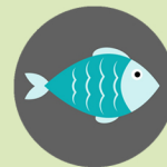
Committee on Fisheries and Aquaculture