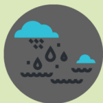
Committee on Climate Change