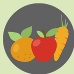
Committee on Fruits and Vegetables * National Mango Action Team