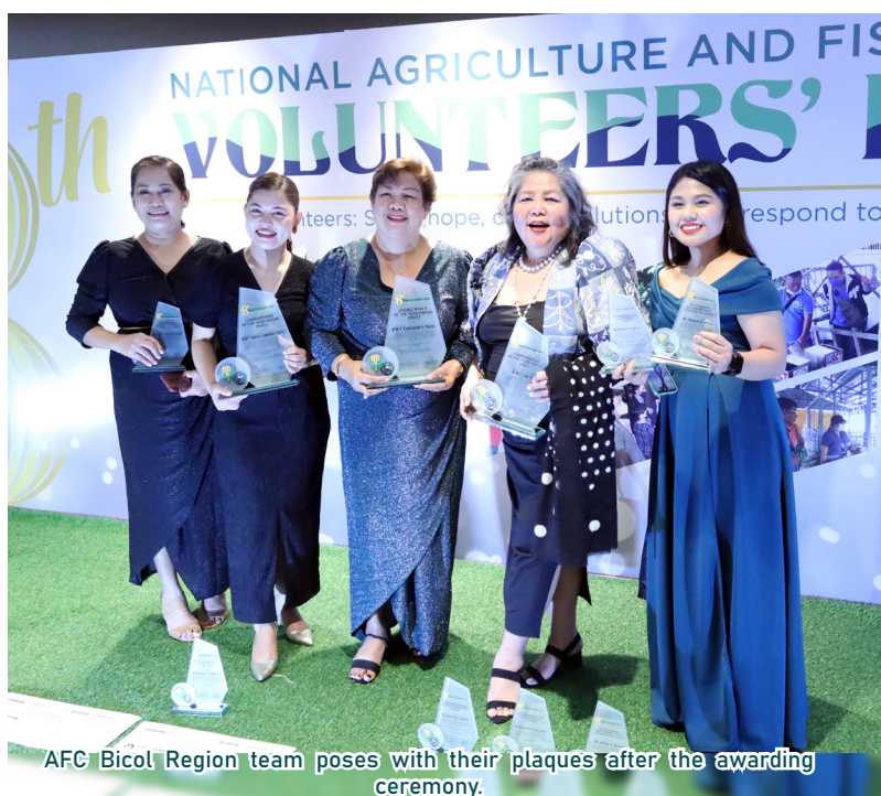
AFC Bicol Region team poses with their plaques after the awarding ceremony.

RAFC Ilocos Region- Sectoral Committee on Agricultural and Fisheries Mechanization and PAFC