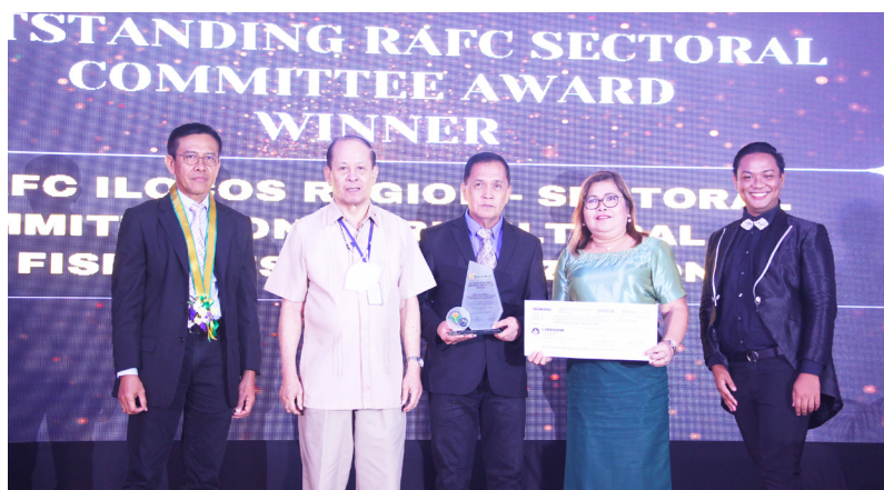
RAFC Ilocos Region Sectoral Committee on Agricultural and Fisheries Mechanization