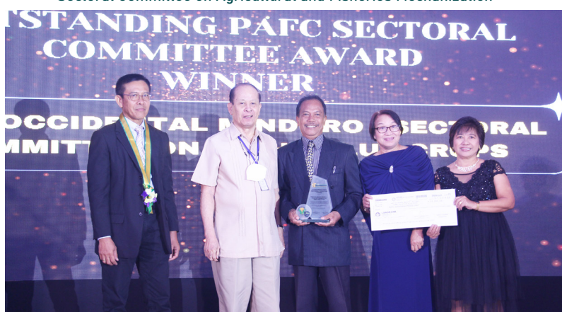
PAFC Occidental Mindoro Sectoral Committee on High Value Crops