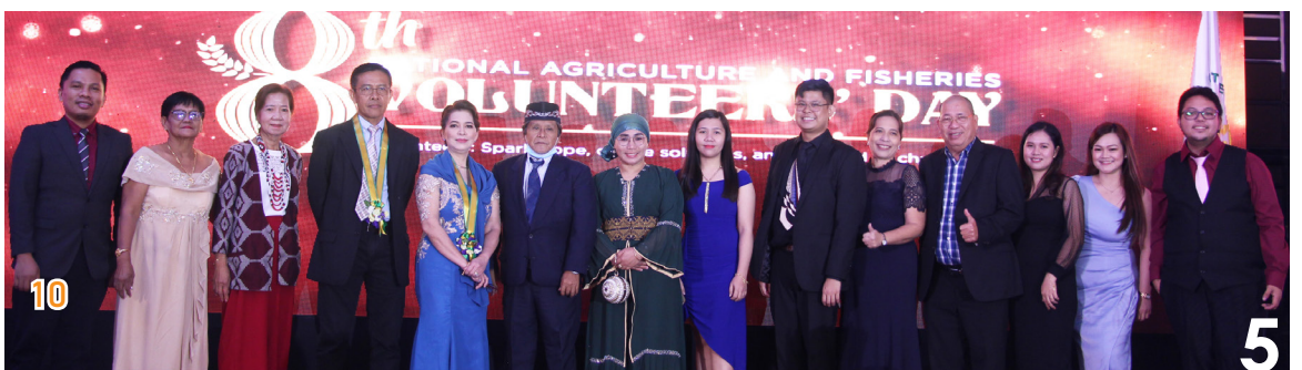
10. Caraga and Bangsamoro Autonomous Region in Muslim Mindanao group